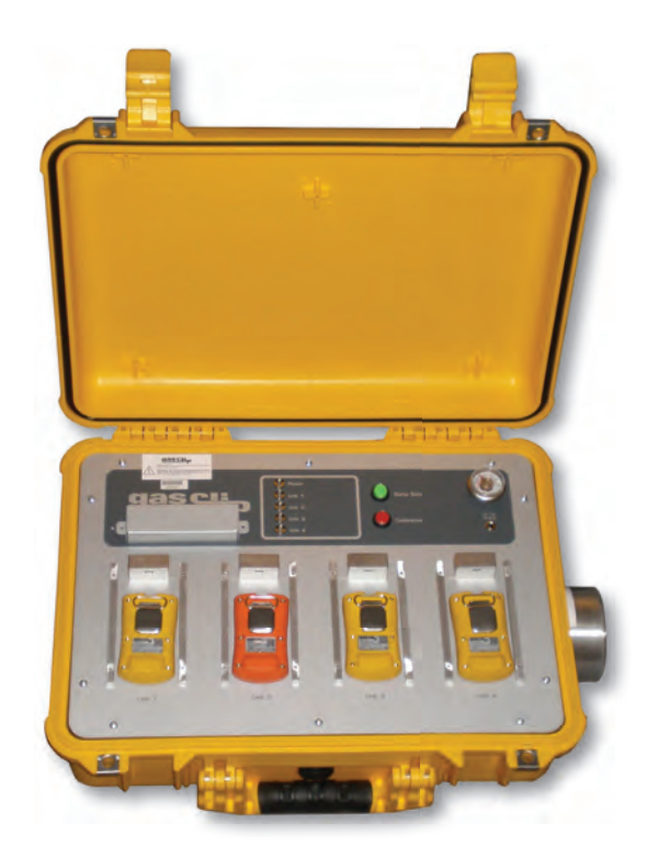
"Clip Dock" Docking Station